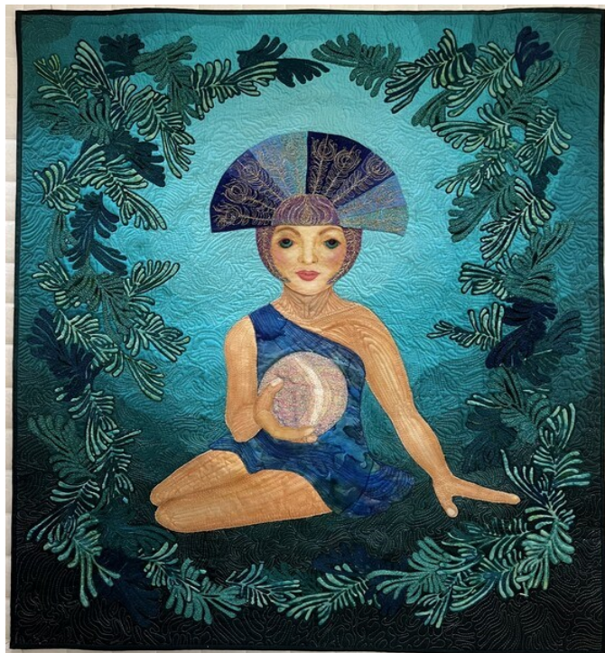
Sandy Sagan - "Future"