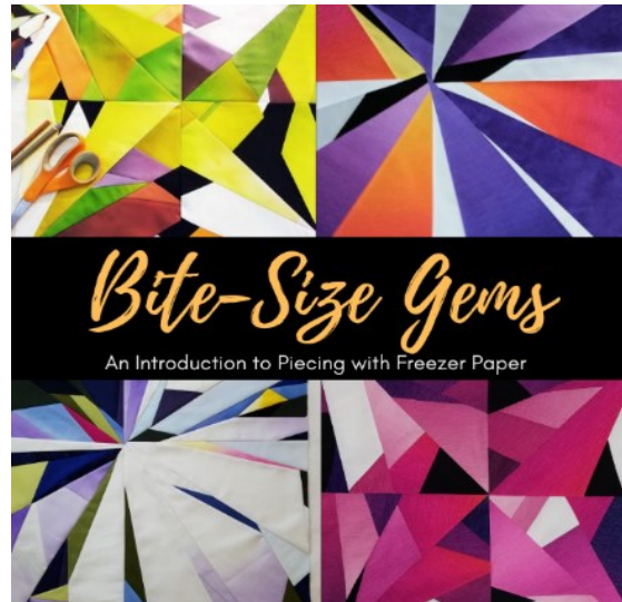
“BITE-SIZE GEMS” Workshop Thursday, July 11, 2024