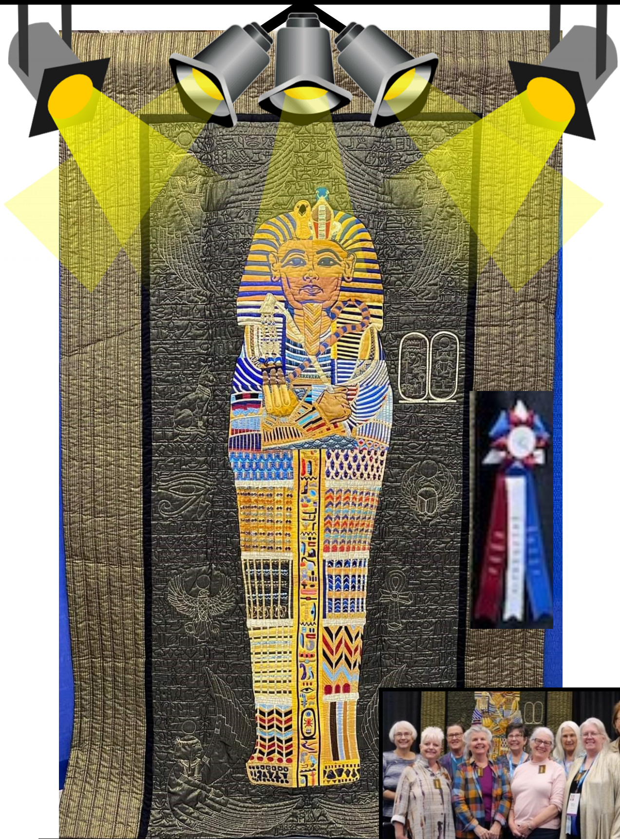
“Wonderful Things - 100 Years of Tutankhamun” Created by the ArtBits Group