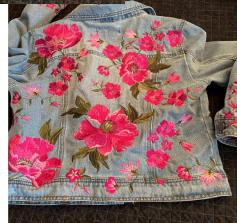
Ann Clark Best Wearable Elegant