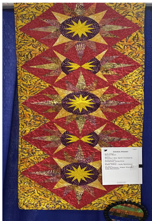
Naomi Noor Best Home Item Cactus Flower