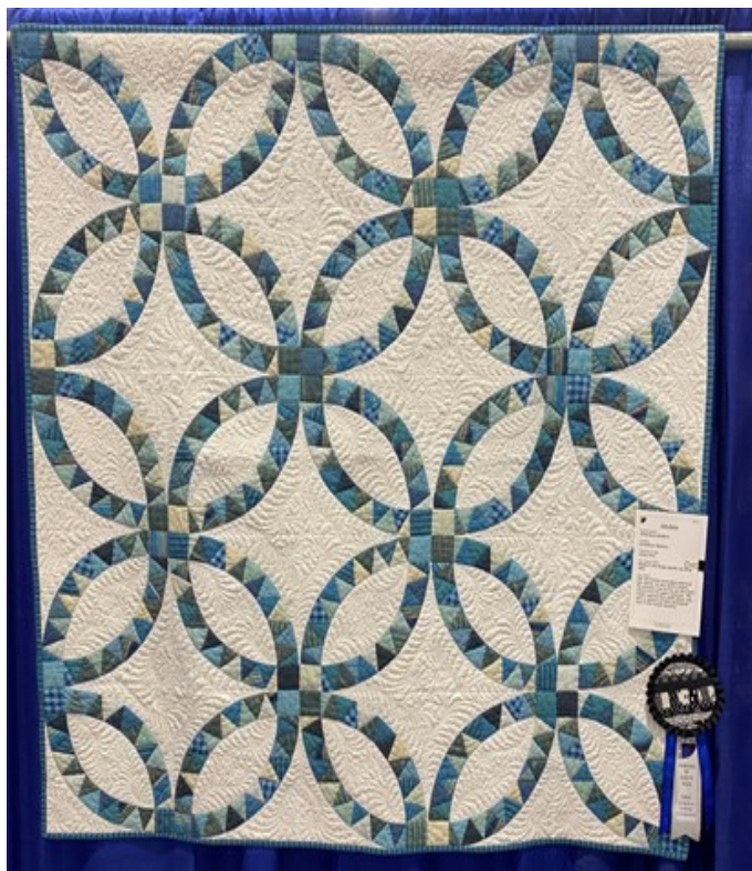
Gretchen Watkin Best Long Arm Quilted - Hand Guided Cat Zone