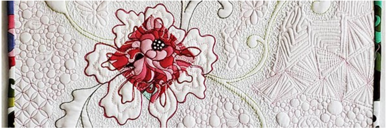
Fearless Free Motion - Start With a Square