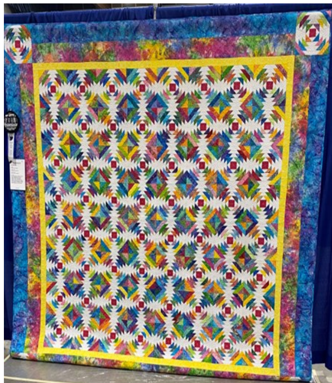
Coke Hennessy Best Long Arm Quilted - Computerized King Size Bed Quilt