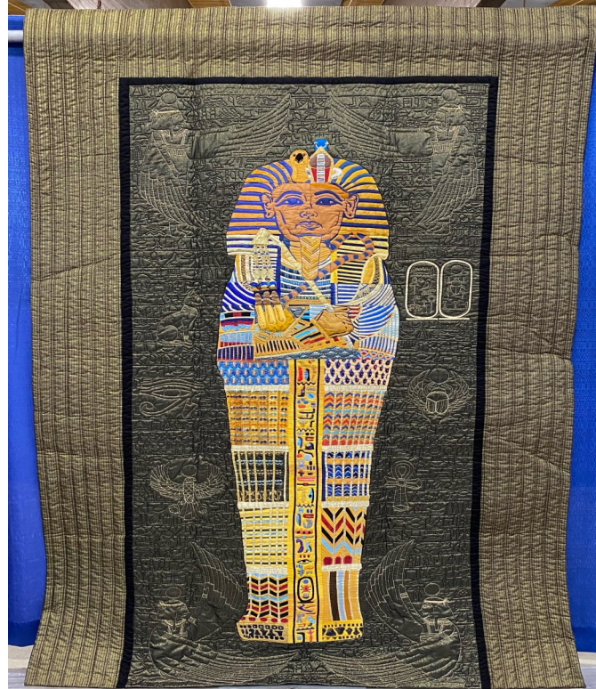
Arts Bits STL

Best Art Quilt; Viewer's Choice 3 Wonderful Things– 100 Years of King Tutankhamun