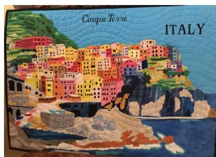
Cinque Terre - Italy Nancy Straate