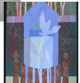
Fence and Flourish