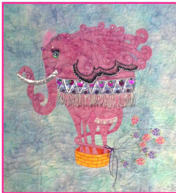
Bella Balloona Polenta de la Luna

Just a little something to make you smile . . .