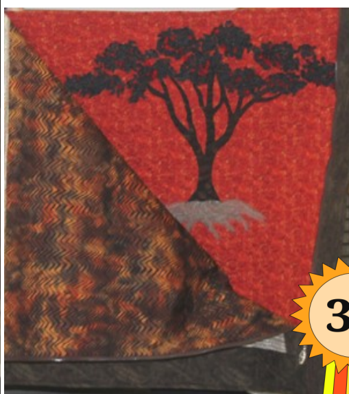
3rd Place - Roxanne Jasper—Side 1 & Side 2