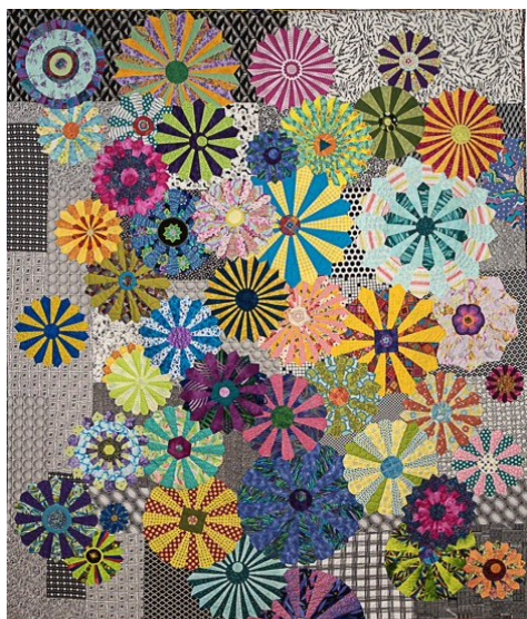
"Service for 12"