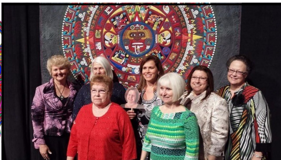
"The Amazing Aztec-nicolor Dream Quilt" 2nd Place—Group Quilts—Paducah 2015 by The Amazing Eight